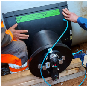
PLATE (d 325 and d 400) allow the processing of all with VL marked saddles. Outlet dimensions from d 160 to d 400.

Battery-operated component PUMP generates and regulates vacuum fully automatically for the joining pressure. No additional power source required.